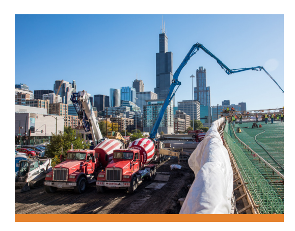
Ozinga Ready Mix has been producing CO<sub>2</sub> mineralized concrete via CarbonCure since 2016.

Ozinga selected 13 basic concrete mix designs produced at four of its concrete plants in Illinois and Florida. Mixes manufactured using slag (mix titles denoted with an "S"), high-range water reducers ("H"), and CarbonCure ("X") were analyzed. The results of this analysis showed that CarbonCure reduced GWP in every mix where it was used, including mixes made with slag. This demonstrates the universal ability of CarbonCure to reduce the carbon footprint of concrete and the stackable GWP benefit of using CarbonCure with other carbon-reducing strategies.