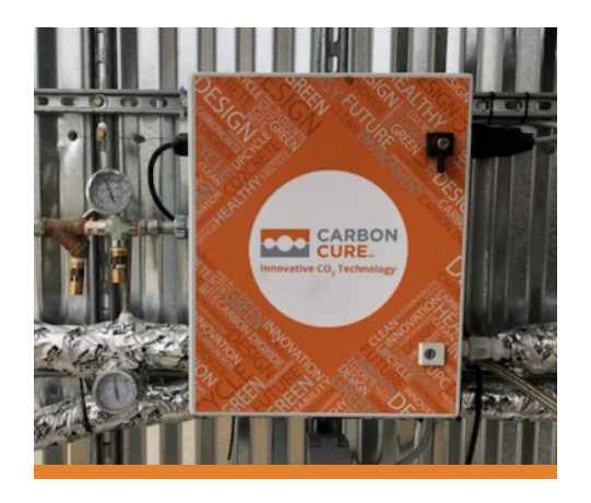
CarbonCure at Ozinga's Miami plant, which became the first CarbonCure system installed in the state of Florida in 2020.